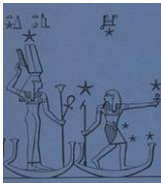
Aset(Sepdet) following Ausar (Sahu)

The star known to our Kemeti ancestors (The Kemetu) as Sepdet (canis major) rose after the Pre-dawn rising Sahu (Ausar); and rose "heliacal" i.e. just ahead of the Sun" in early July. Due to the wobble of the earth on its axis Sepdet now rises a few weeks later.